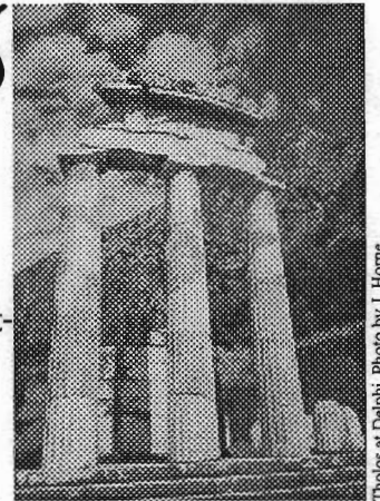
Tholos at Delphi.