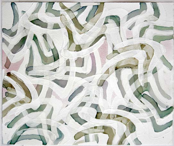
William T. Dooley, "Untitled (Composition with Oxbow on Flesh Ground)," 2008, organic inks, pencil, and gesso on paper, 9¼ x 11¼". This and other department members' works appear in the Auburn juried exhibition, "Drawing on Alabama 2009." See page 2.