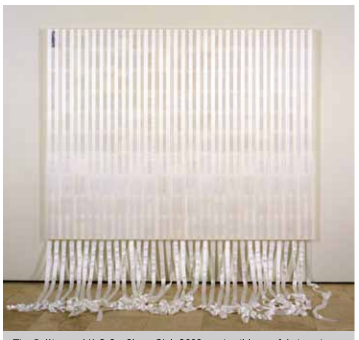
Tim Rollins and K.O.S., Slave Girl, 2008, satin ribbons, fabric paint and book pages on canvas, 174 \times 108 "