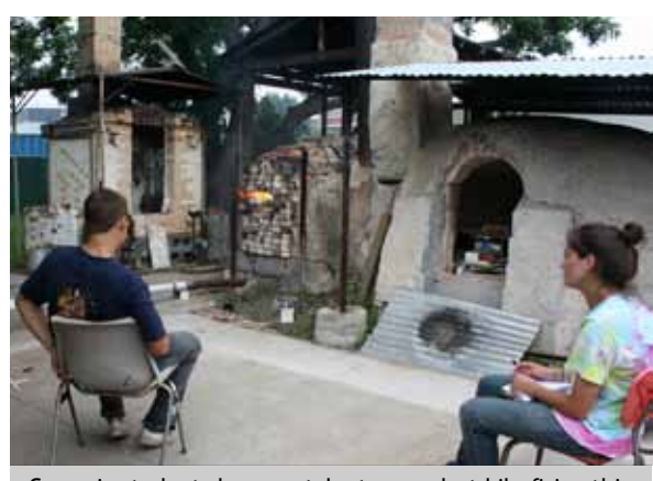
Ceramic students keep watch at a sawdust kiln firing this summer.

America Redefined, will run through Sept. 18.