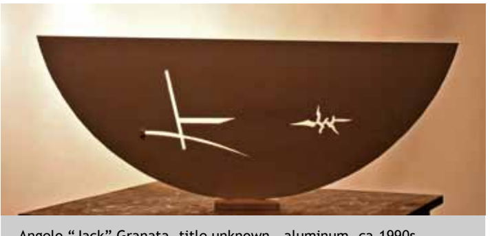
Angelo "Jack" Granata, title unknown, aluminum, ca.1990s