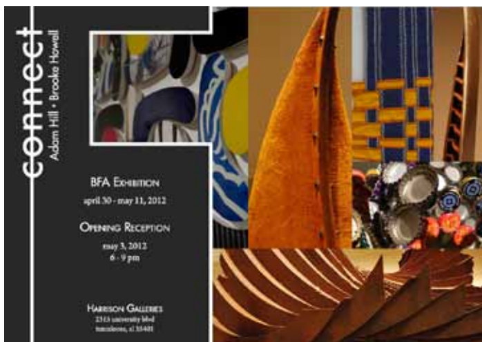
TOP RIGHT: Roger Jones, Three Among Many , 2012, charcoal, 4" x 6". CENTER: Aynslee Moon, Fish , 2011. ABOVE: Brooke Howell, exhibition showcard, 2012.

More photos: http://www.flickr.com/photos/uaart/collections/