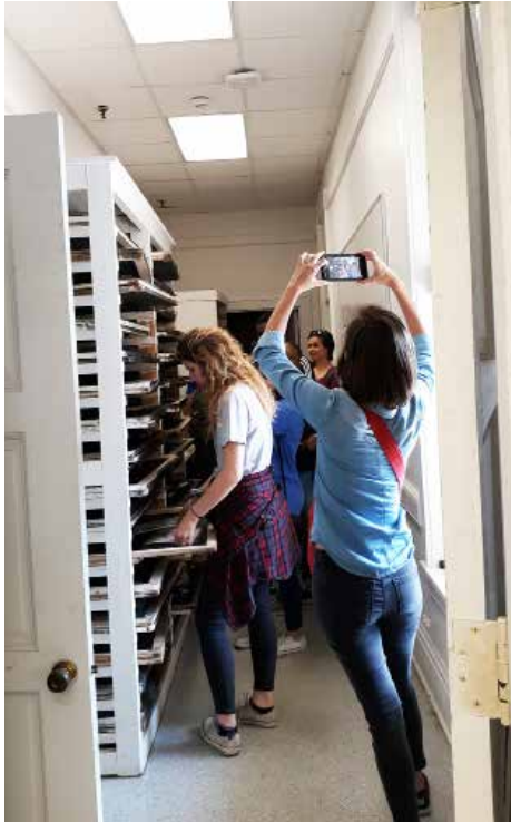
ABOVE: BTW Photography students toured the department in October. Here they look at the equipment in the photography area in Woods Hall. BELOW: BTW students at their booth at the 47th Annual Kentucky Festival. RIGHT BELOW: BTW students tour the Sarah Moody Gallery of Art.