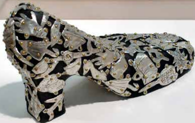
Female Power, Shoe, 2013 By Claudia Castañeda (Buenos Aires, 1966) Mixed media sculpture 5 7/8 x 5 1/2 x 8 inches Gift of Boris Shumakov P. 10, 11